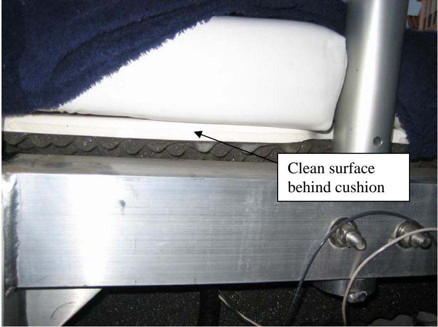
Figure 3. Location of adhesive for back cover- engine area.