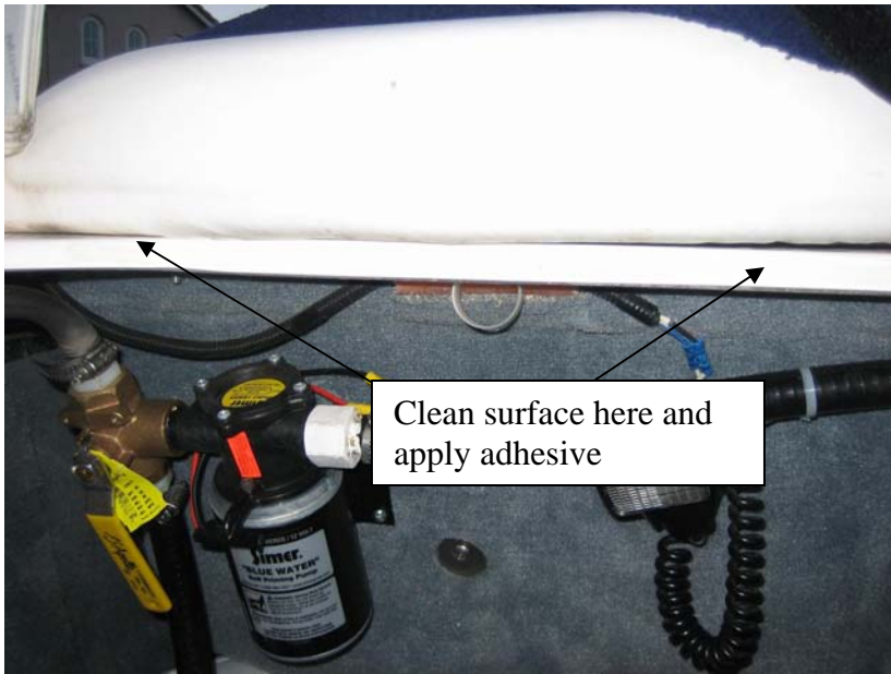
Figure 1. Location of adhesive for back seat cover- Port side truck