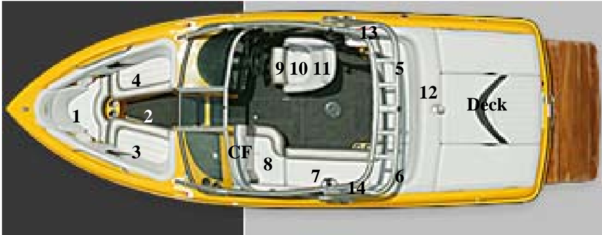
Figure 5. Boat Seat Numbers