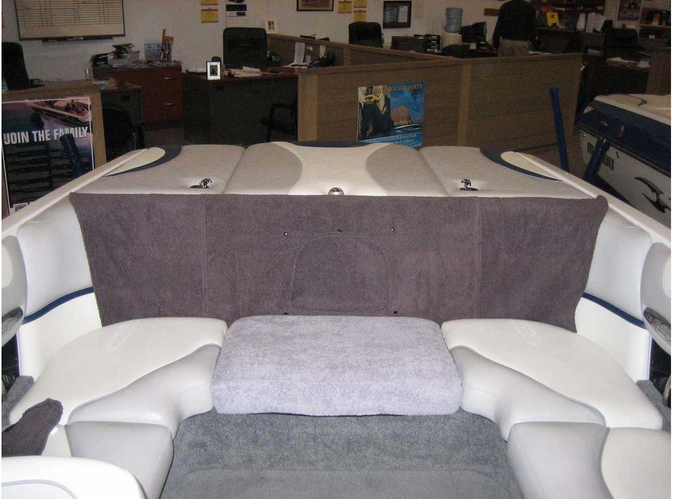
Figure 2. Back Seat Center cover fully installed.