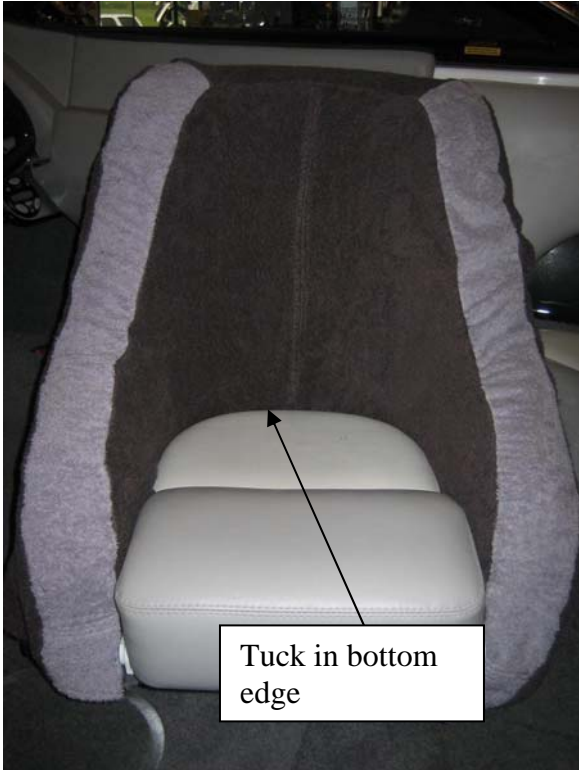
Figure 3. Driver seat front view