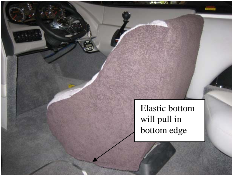
Figure 4. Driver seat side view. Picture shown without elastic on bottom edge.