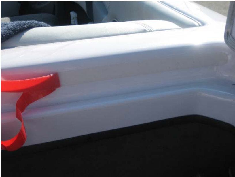
Figure 6. Rear seat cover adhesive location