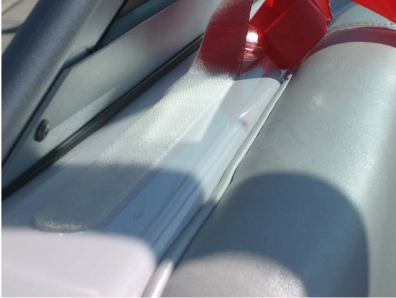
Figure 5. Adhesive location, corner seat, window, zoom