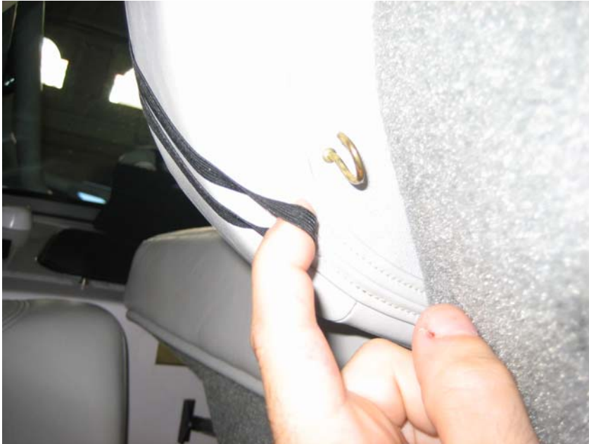
Figure 1. Corner seat eye hook location

Once the adhesive is installed LET STAND FOR 48 HOURS to gain maximum bond strength.