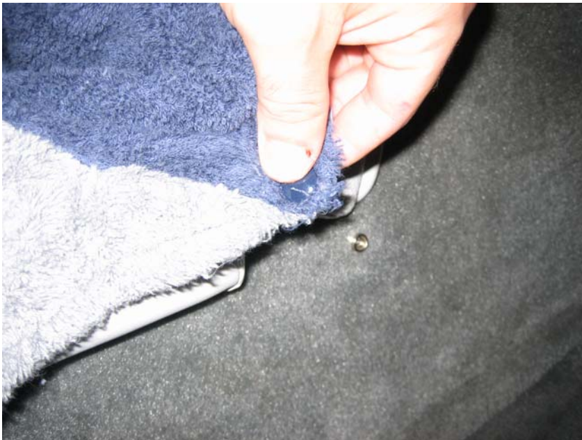
Figure 2. Corner seat snap location