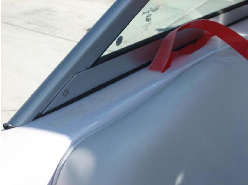
Figure 4. Adhesive location for corner seat, window