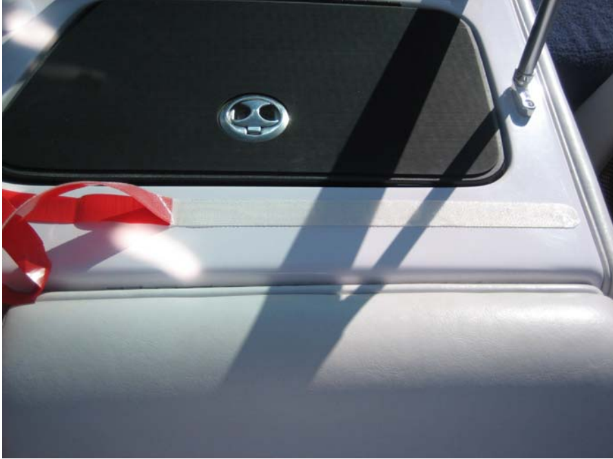
Figure 3. Adhesive installation for corner seat, glove box